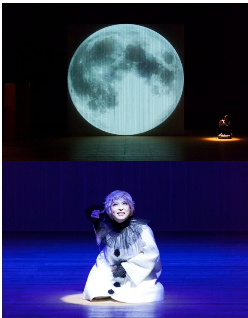
Act 1- evening tale

Mugen Noh-Pierrot Luneaire is a complete performance piece. With refine additional Noh scenes woven into the original Pierrot Luneaire, 35 minutes length program is presented here as an 1 hour and 15 minutes program. The stage sets are minimal, and the visual art is used for both artistic effects and subtitling which brings the music of Schönberg clearer and help to bring the performance closer to the audience. Having minimal stage sets, we succeed in keeping the authenticities of the two diverse world, and it enables the production to be performed in various kinds of concert halls and stages.